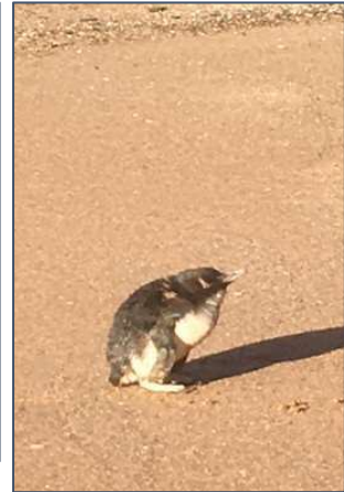
Little Blue Penguin (Little penguin/kororā), whose conservation status is " At Risk – Declining ", spotted on Tattershal Beach (Taiaue Bay) 26 April 2023

Follow and like us on our new Facebook Page – Mahinepua Radar Hill Landcare Group https://www.facebook.com/Mahinepua-Radar-Hill-Landcare-Group-116005128097984