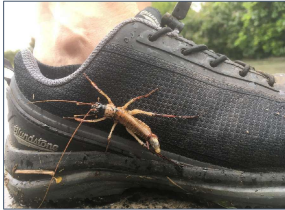
A hitchhiking Auckland Tree Weta ( Hemideina thoracica ), whose conservation status is not threatened, spotted (unexpectedly) on Radar Hill, 9 April 2023.

Casey has kindly shared some interesting photos with us. Thank you Casey.